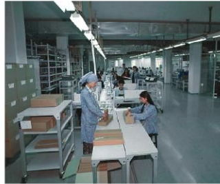
Final Assembly Line