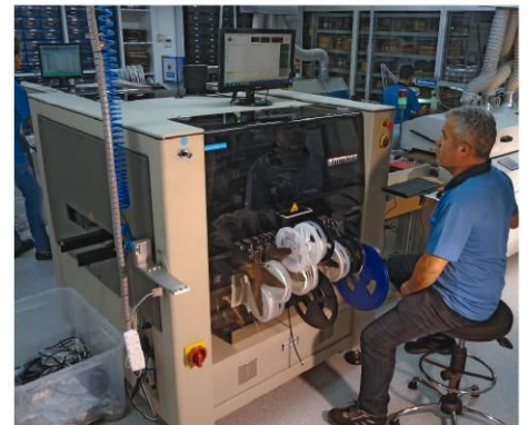
SMD Pick & Place Machine