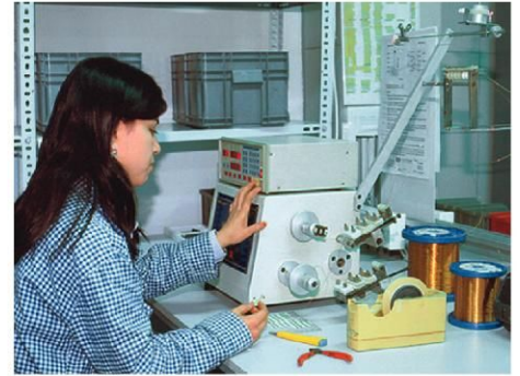
Coil & Transformer Winding