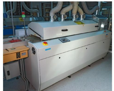
SMD Soldering Ovens