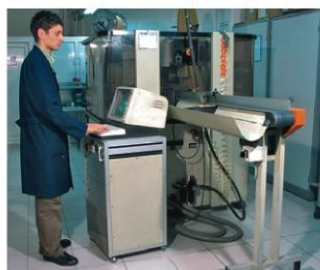
Cable Stripping & Crimbing